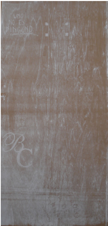
White on craft