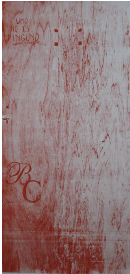
Brick on white