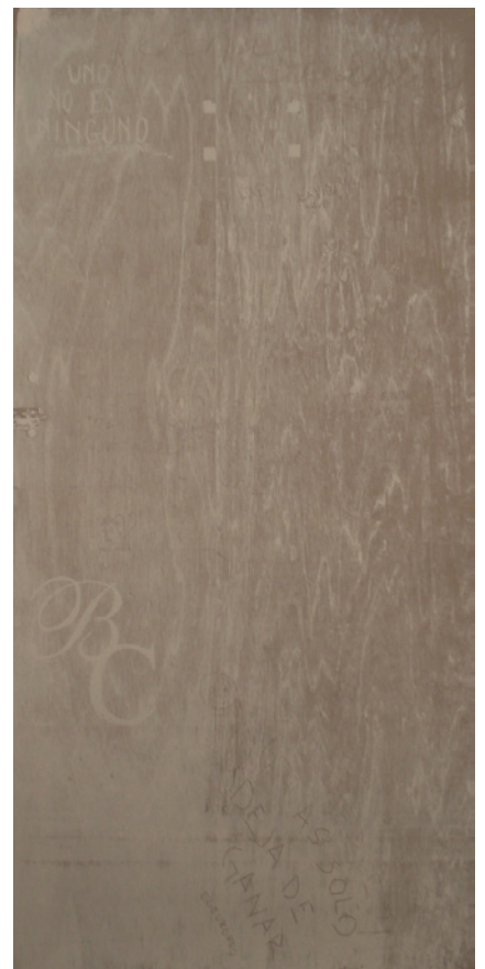
Beige on craft