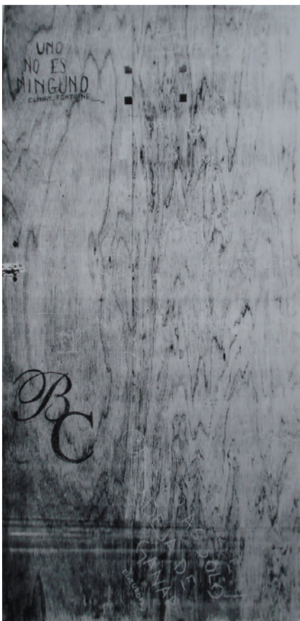
Black on white