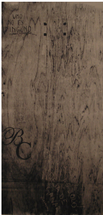
Black on craft