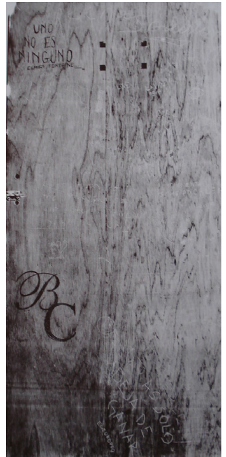
Brown on white